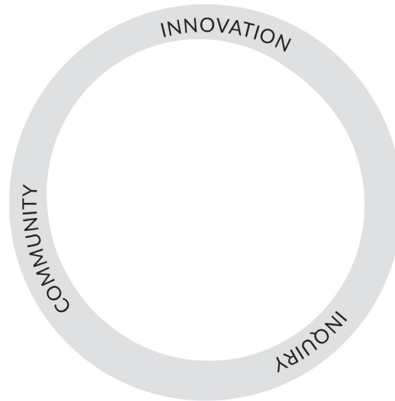
Figure 1.1 The key elements of inquiry-driven innovation.